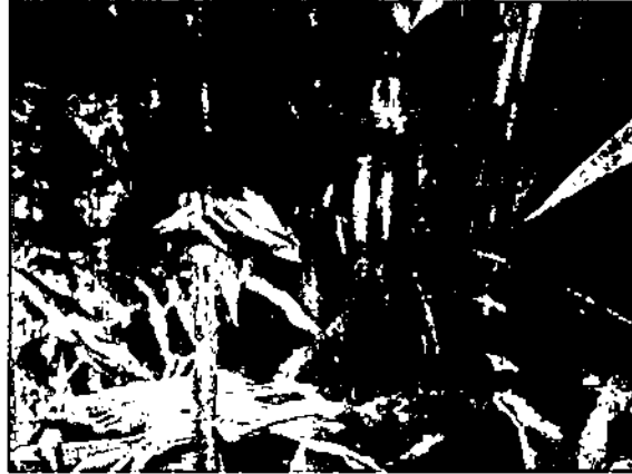
"Cut" corn stalks not caused by insect damage.