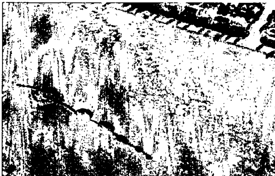
The Vacaville, CA, crop circle in corn.

to crop circle researchers in the United States and Canada who we knew had experience in investigating corn crop circle formations, and who we had been in contact with about the Vacaville formation already, to join us for the world's first International Tele/Video Investigation (TVI) of a crop circle formation.